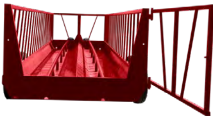
■ End-Gate Style