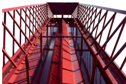
■ Basket Style