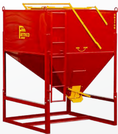
Bulk Bin 3.0