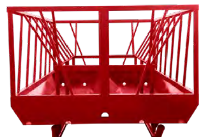
■ Skid-Feet Style